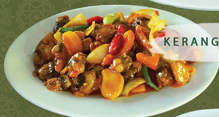
KERANG SAUS PADANG