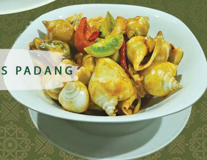
GONG GONG SAUS PADANG