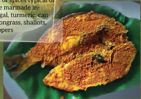
IKAN BAKAR KECAP Grilled Fish with sweet soy sauce

"Ikan bakar bumbu" is a traditional grilled fish dish seasoned with a blend of spices typical of Belitung. The marinade includes galangal, turmeric, candlenuts, lemongrass, shallots, and chili peppers