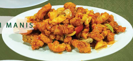
CUMI ASAM MANIS