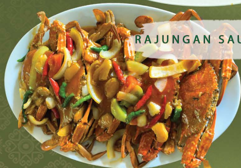
RAJUNGAN SAUS PADANG