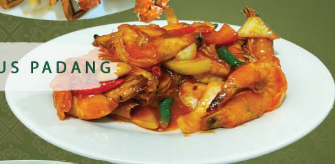
UDANG SAUS PADANG