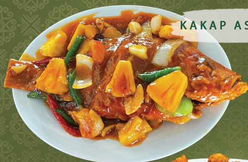
KAKAP ASAM MANIS